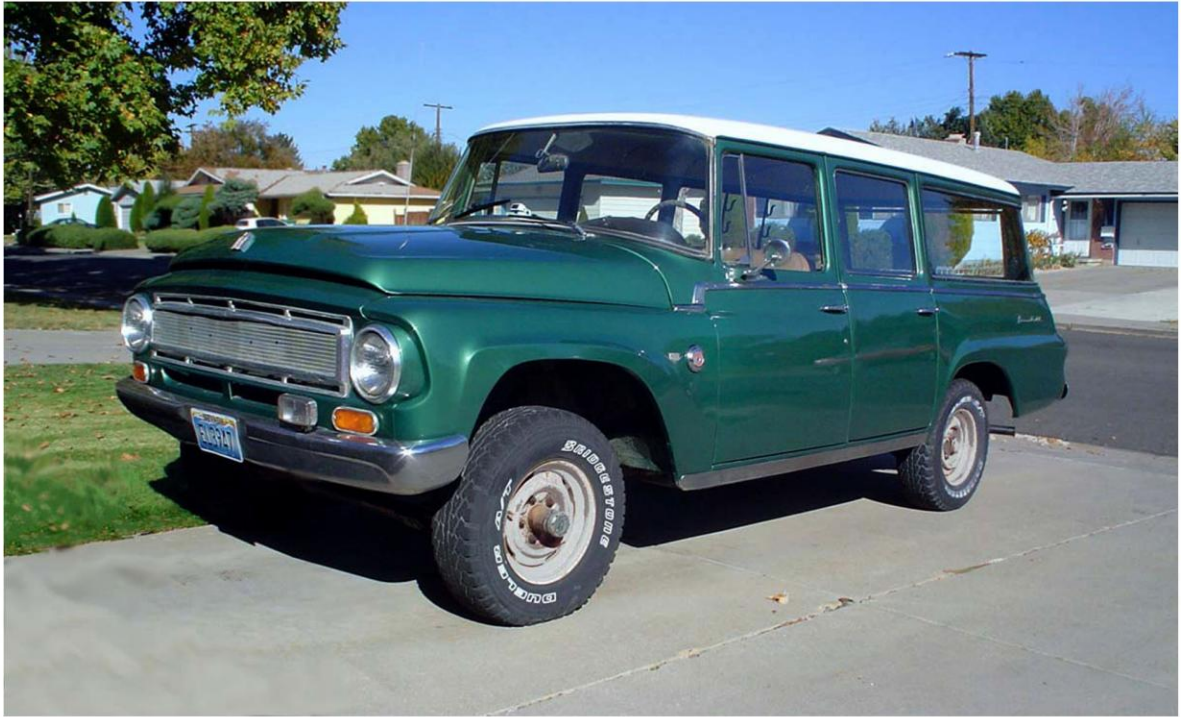
1967 Travelall in 2006