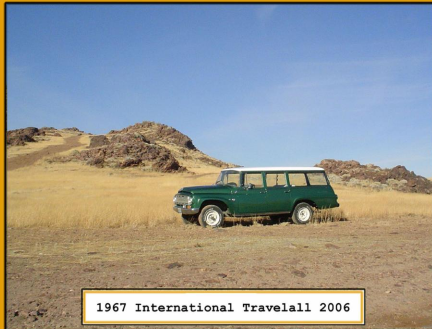
1967 International Travelall 2006